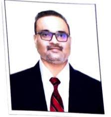
Passport Size Photograph